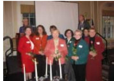
Fall 2009 Mayflower Inductees